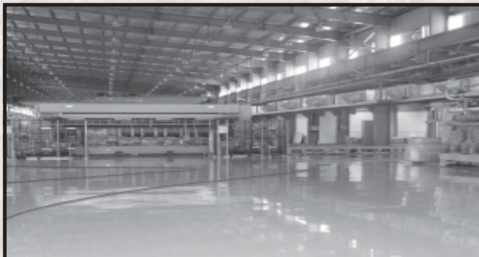
Shendra, Maharashtra, India